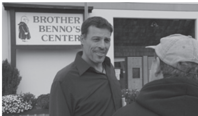
Tony Robbins and guest