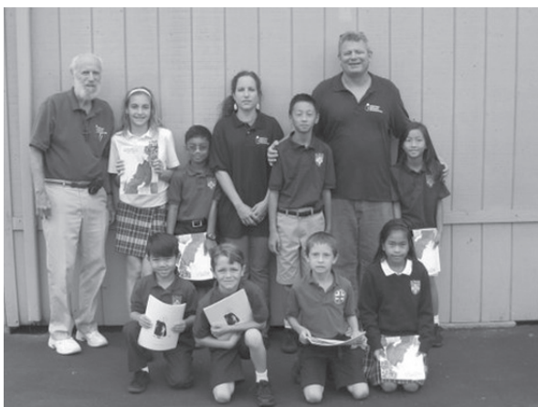
Readathon Students from St. Patrick School