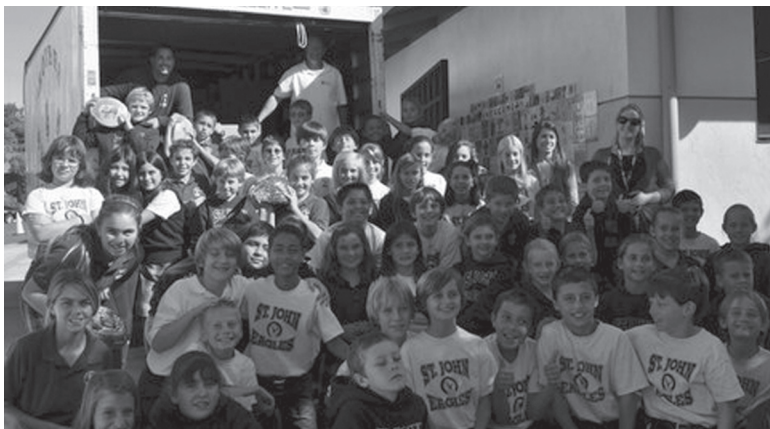
Students from St. John the Evangelist School