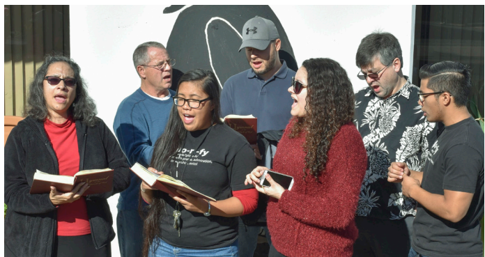
Escondido Church of God Singers