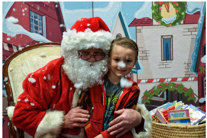
Santa and a guest