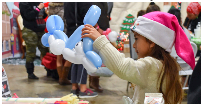
Guest enjoying balloon animal