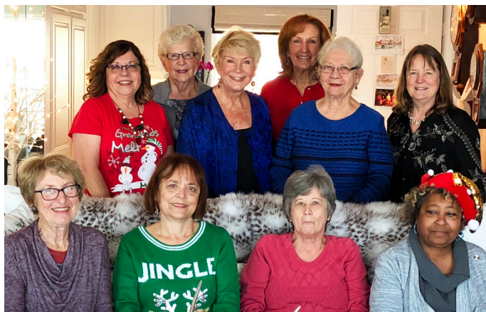
Luncheon Fundraiser Committee