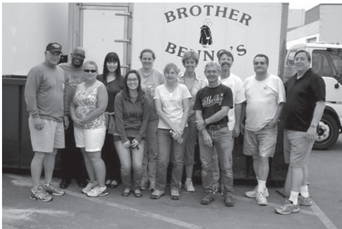
Food Drive Volunteers

Information & Online donations: brotherbenno.org