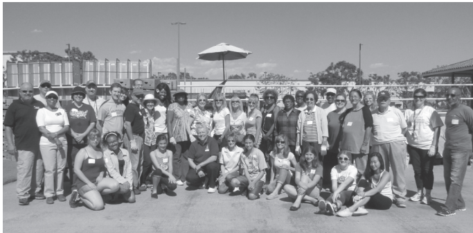
Food Drive volunteers