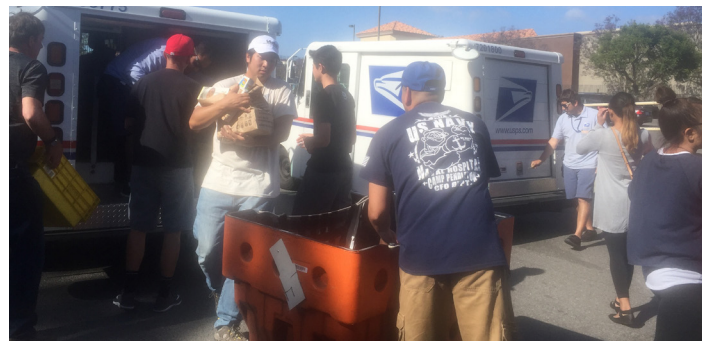
Camp Pendleton Volunteers