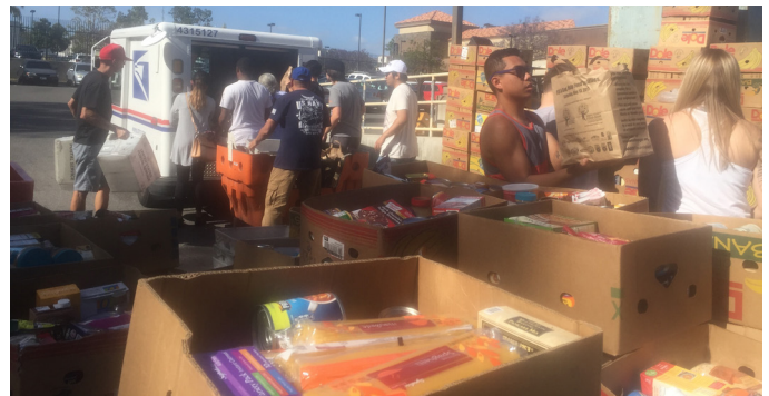
Camp Pendleton Volunteers