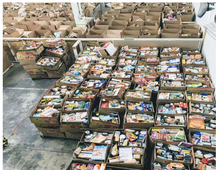
Lots of Food!