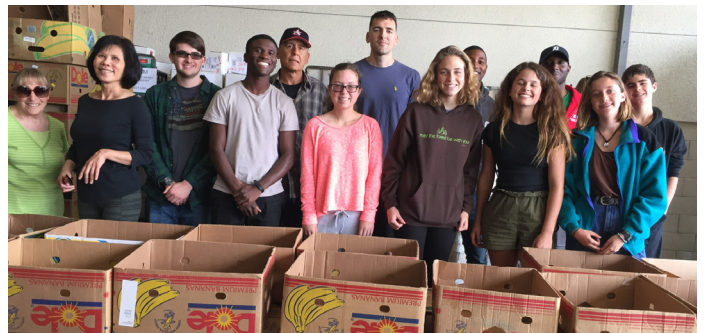
Food Drive Volunteers, La Costa Post Office