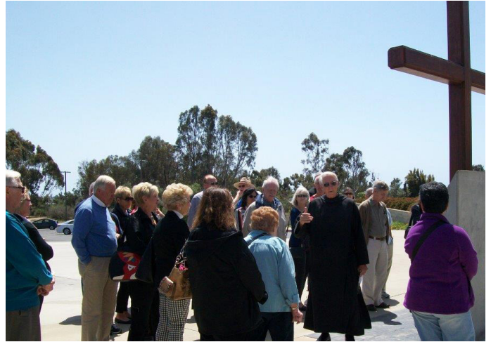
Prince of Peace Abbey Tour

23, in the Center Dining Room. Social time and snacks start at 1 p.m., followed by the meeting at 1:30. We welcome all to join us and give your input. Can't attend a meeting but want to become a member? Download our membership application at http://bit.ly/2oGkaB9