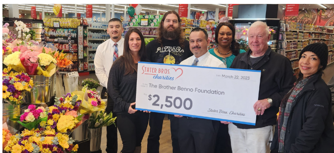
$2,500 Grant From Stater Brothers

Your donation enables us to do all the wonderful things we do