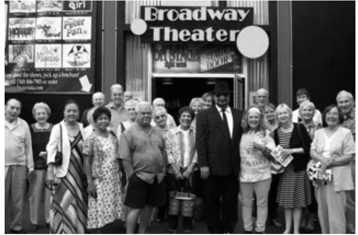
Auxiliary Fundraiser at Vista Broadway Theater