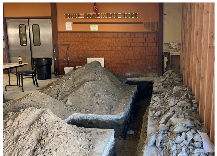
More construction photos on page 4...