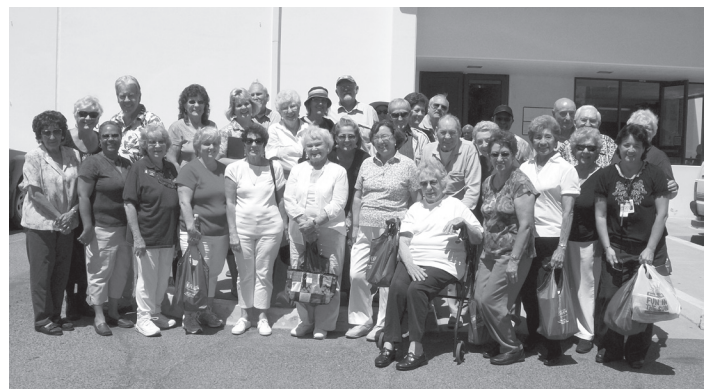
San Onofre tour