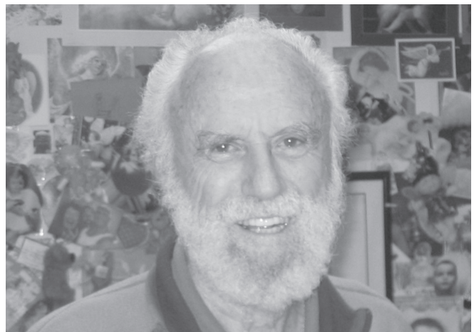
Beloved and wise and young enough to play tennis!