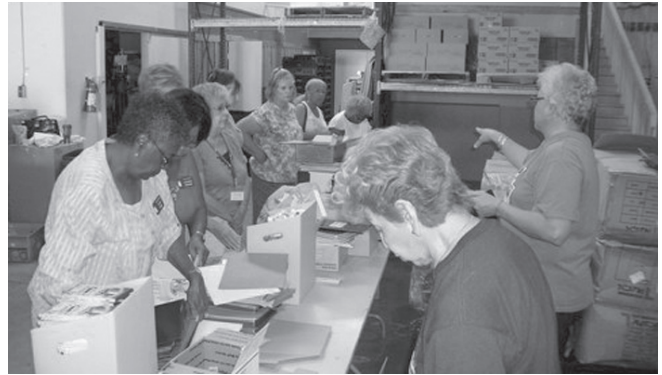
Getting backpacks ready