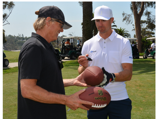
Drew Brees signing footballs

We appreciate your generosity and enthusiasm for our mission to uplift the dignity of those we serve. Many made this day a memorable and meaningful one for us.