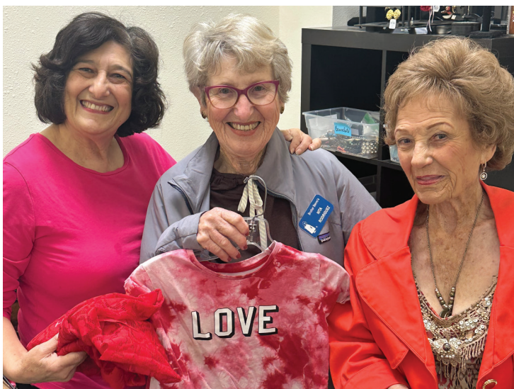
Look what our Thrft Shop volunteers found. The perfect Valentine's tee! You can find unique treasures, collectibles, one-of-a kind items & more - 7 days a week.