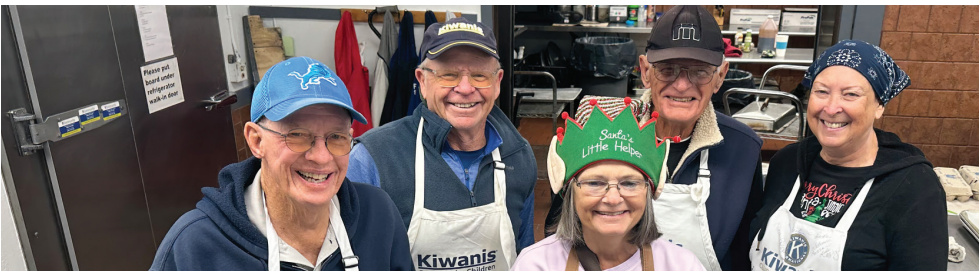
Thank you Vista Sunrise Kiwanis serving team!