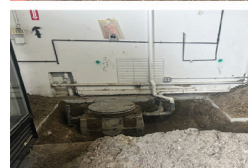
Pardon our dust! Warehouse plumbing work.