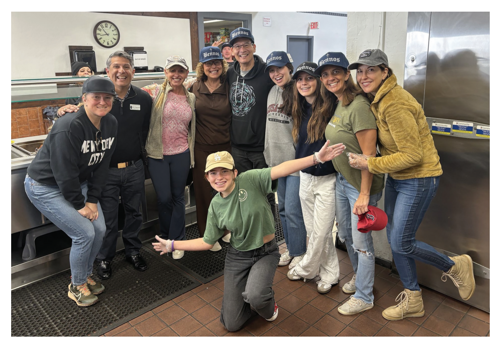
Thank you La Costa Valley Volunteers for dropping off amazing donations AND serving our guests with a smile!

We deeply appreciate the support of our community partners, volunteers, and donors. Sadly, we only manage to document a small portion of these acts of kindness. If you have a photo or story you'd like to share, please send it to us at <a href="mailto:bbnewsletter@brotherbenno.org">bbnewsletter@brotherbenno.org</a>. We'd be delighted to feature your story!