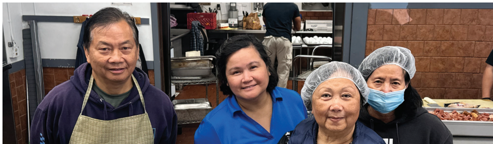
San Rafael Parish Serving Team