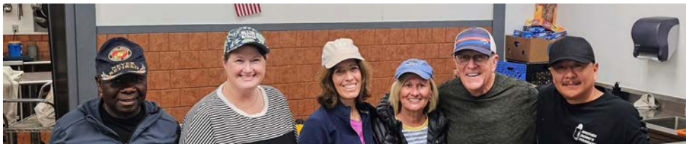
Thank you Rotary Club of San Marcos Serving Team!