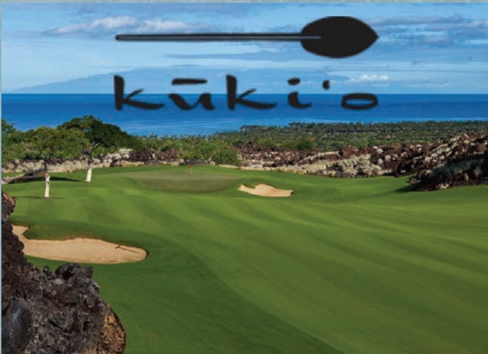
A FOURSOME AT KUKI'Ō GOLF COURSE, HAWAII // $2,000 VALUE