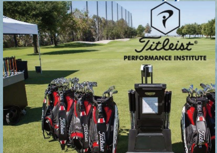
TITLEIST PERFORMANCE INSTITUTE // $1,400 VALUE