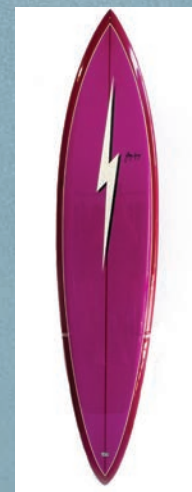
GERRY LOPEZ AUTO-GRAPHED AND SHAPED SURF BOARD // $15,000 VALUE