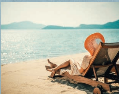
TIMESHARE AND LAKE TAHOE HOME GETAWAYS // $1,000 - $4,000 VALUES